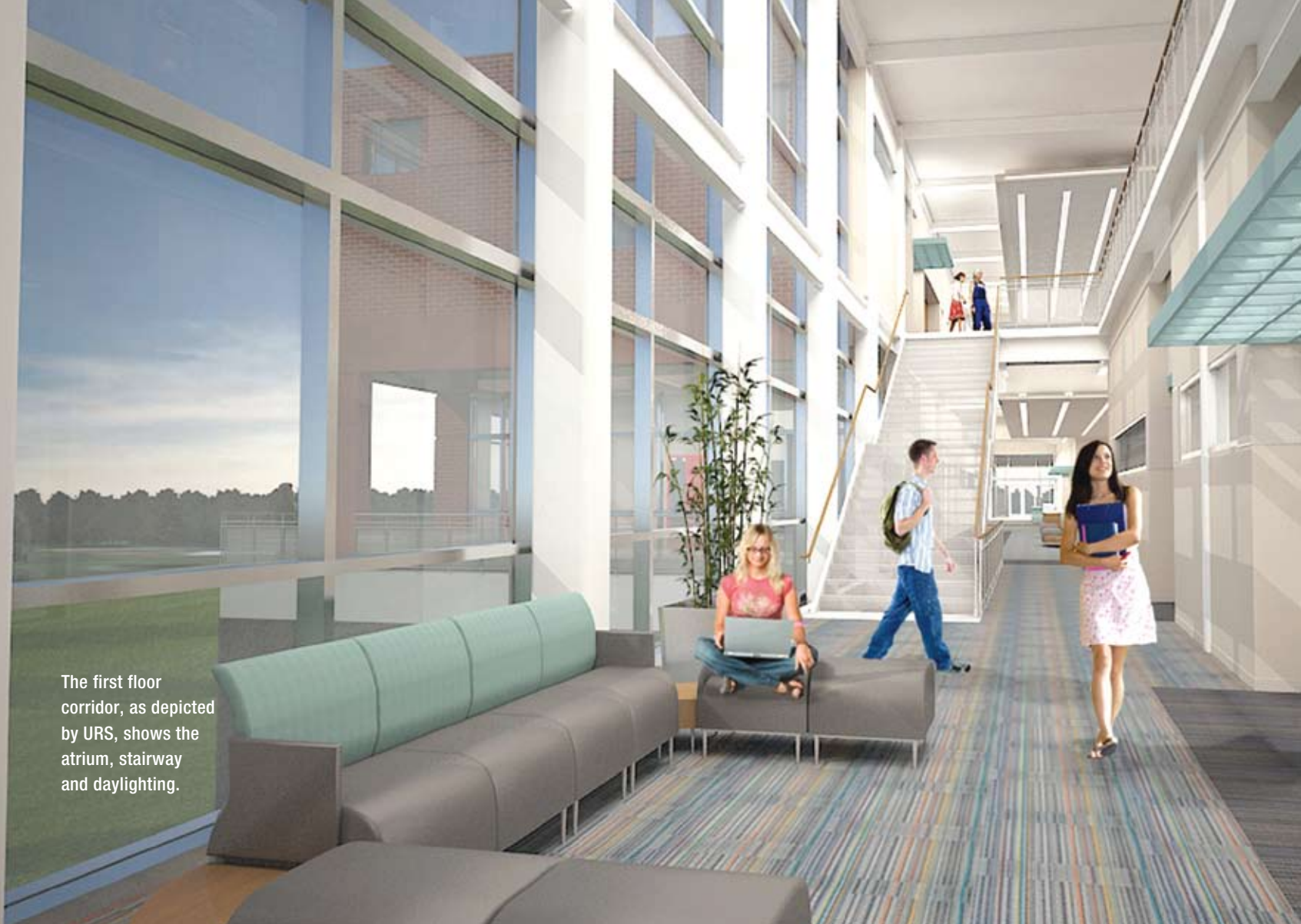
The first floor corridor, as depicted by URS, shows the atrium, stairway and daylighting.

Indoor environmental quality. HVAC ducts are being kept clean during construction by Ozanne. Occupancy sensors will control lighting, and control systems will also be used to monitor outdoor air use during operation. Low-VOC-emitting materials are being used, and occupants will have control over their own spaces, with the project expected to earn about 9 points of 15 in this category. Horizon Engineering is handling the enhanced commissioning and will provide a manual which will help the school's facilities manager run the building most efficiently.