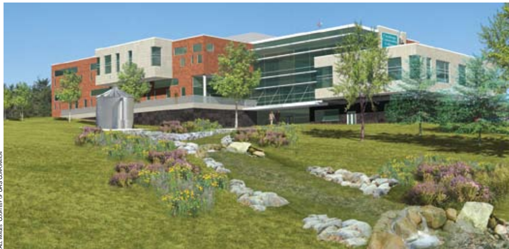
The HCT building is situated on a prime spot for sustainable landscaping.

The Health Careers and Technology Center is the initial kickoff to Phase One of Tri-C's master plan, including demolition of the MetroHealth 200,000-sf skilled nursing facility and nurses' dormitory, as well as existing underground service tunnels, and redeveloping the 41-acre site successfully. Conversant with Ohio HB 251 requiring schools to address energy conservation issues, the HCT building is hoped to achieve a minimum of LEED Silver rating. It will house classrooms, labs and offices for the physician's assistant, physical therapy and occupational therapy disciplines, to serve programs such as massotherapy and pharmacy technician training. Construction began in January 2009, and it will open next spring. It is one of six commissioned LEED projects for the college. URS collaborated with Tri-C on the design of the new 61,500-sf building, with a construction cost of $13.5 million that will bring together programming from several locations and buildings. Consolidating the health careers programs will create academic synergies within the new building. The project is a massive experience, involving no fewer than 16 primes and 50 subcontractors, and the project pays out a million dollars a month, it is said. Gilbane serves as owner's representa-