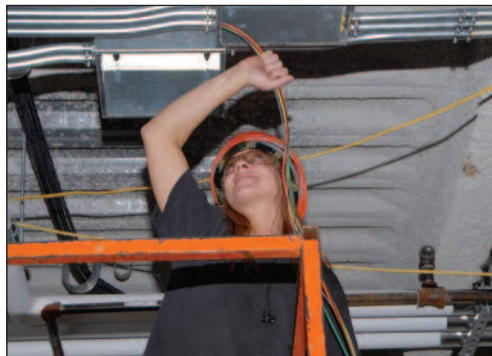
Wiring for lights