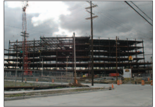
Raising the steel frame