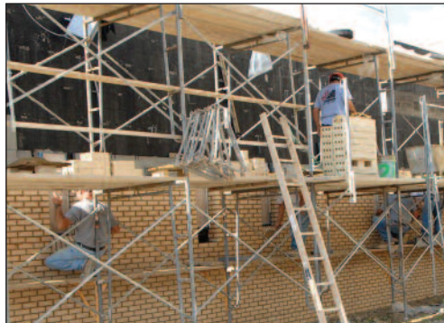
Masonry work and brick laying