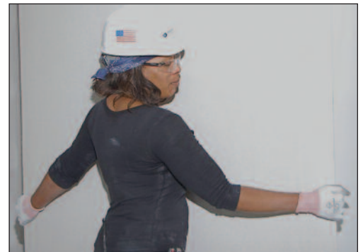
Hanging the drywall