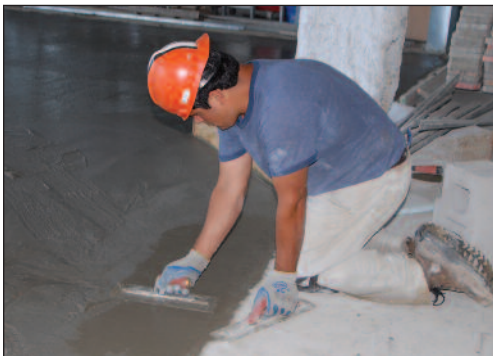
Finishing the concrete