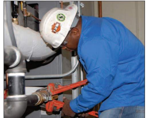
Installing the HVAC