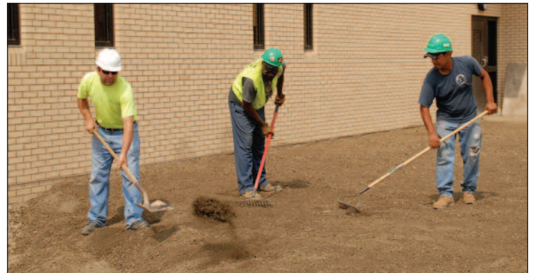
Laying the landscape

"Every new beginning comes from some other beginning's end." – Seneca