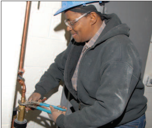
Piping for plumbing