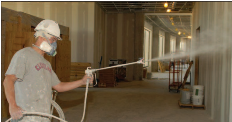
Painting the walls